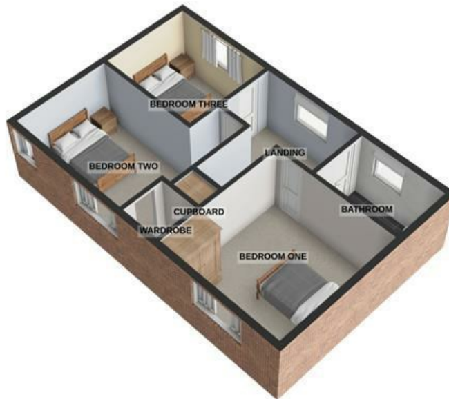
TOTAL FLOOR AREA : 1138 sq.ft. (105.7 sq.m.) approx.

For illustrative purposes only. Decorative finishes, fixtures, fittings and furnishings do not represent the current state of the property. Measurements are approximate. Not to scale. Made with Metropix © 2025